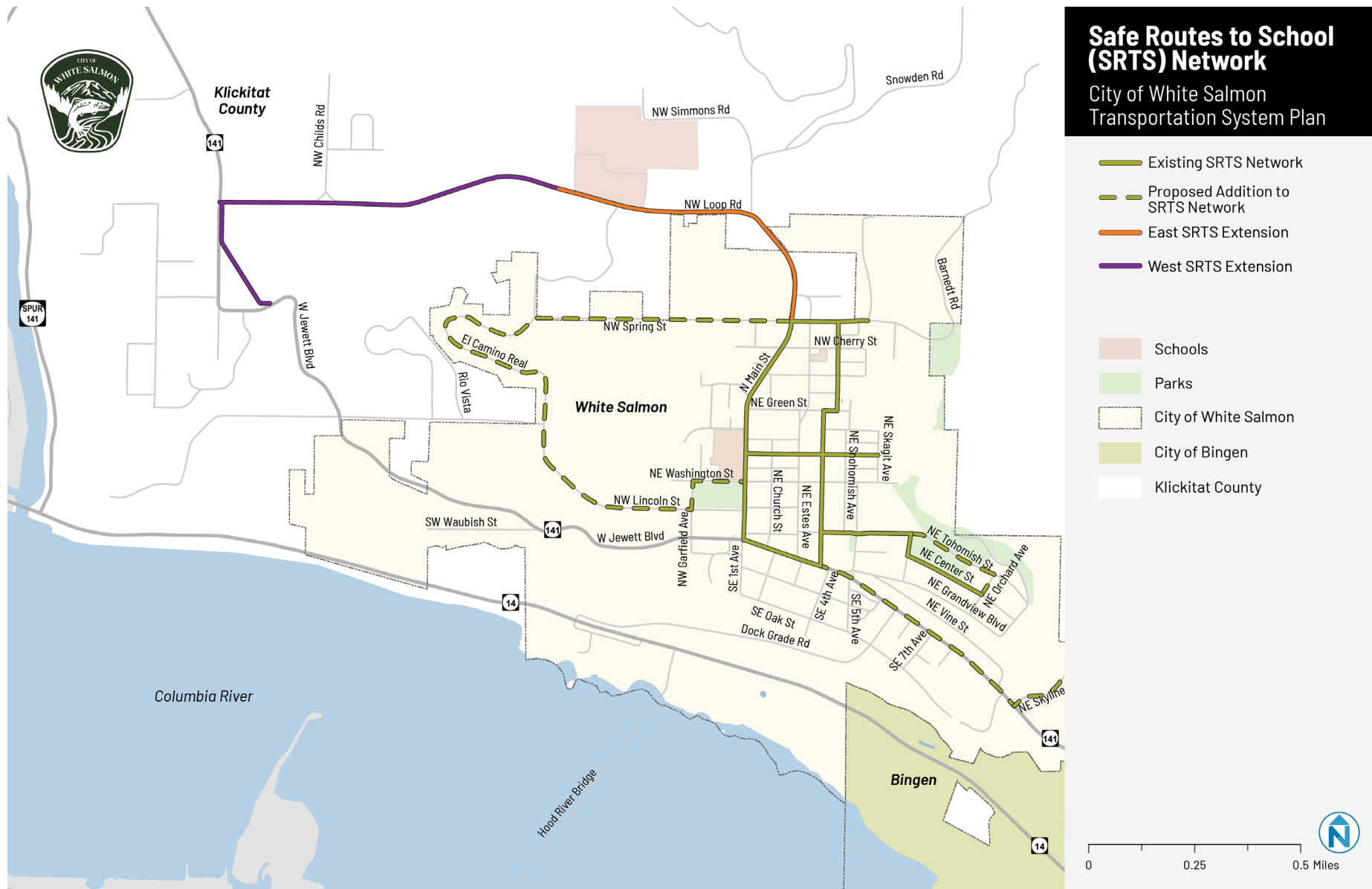
Figure 7 Safe Routes to School Network and County Extensions