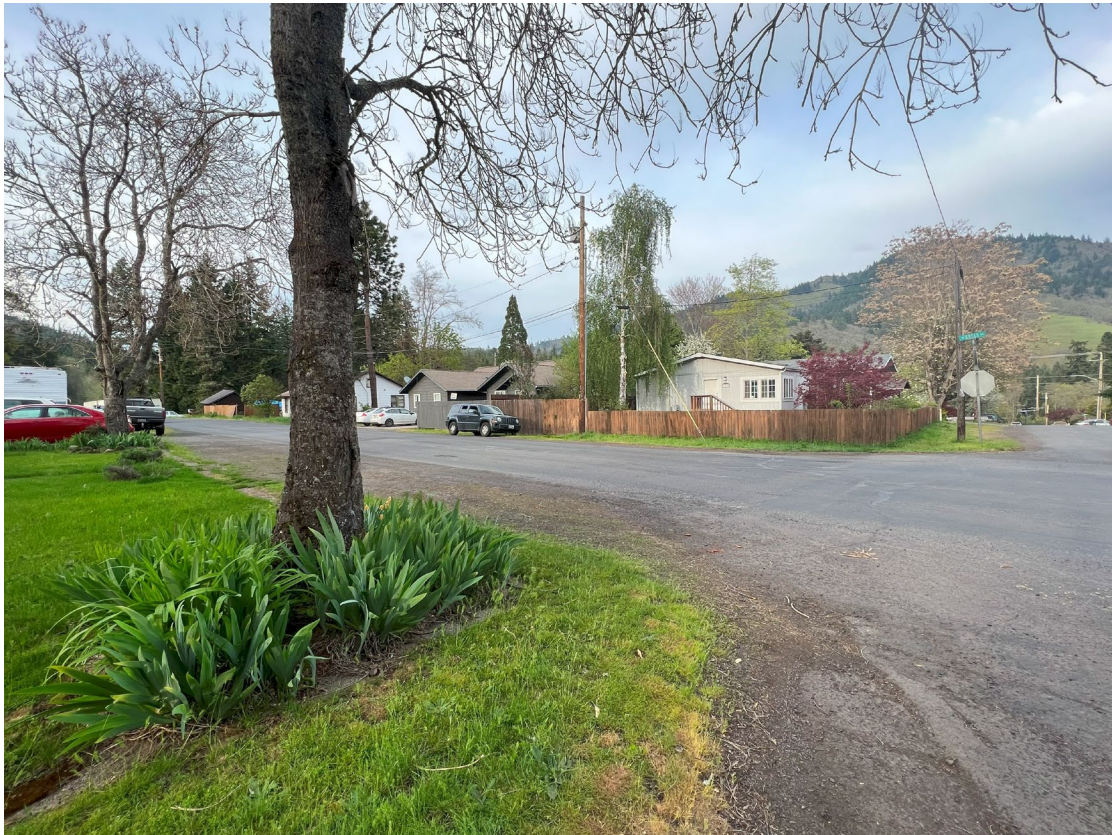
Many streets do not have sidewalks.

White Salmon has designated a network of streets and walking paths as a Safe Routes to School (SRTS) network connecting to Whitson Elementary, the only public school inside the city limits. The network includes portions of Center, O’Keefe, Tohomish, Hood, Main, Jewett, Wauna, Fields, and Spring streets (Figure 7). This plan includes a December 2021 resolution considered by Klickitat County, which would extend the SRTS network to include areas outside the city limits connecting to Henkle Middle School and Columbia High School along NW Loop Road and NW Jewett Boulevard. Appropriate safety and access improvements for students along and across school walking and bicycling routes may include traffic calming (e.g., speed humps and neighborhood traffic circles), crosswalk and crossing improvements, modifications to speed limits and zones, lighting improvements, pathway connections, and bikeways. Projects along and across this SRTS network may be eligible for Washington State Safe Routes to School program funding (see the Funding section of Chapter 6 below for further detail). The City will work with the White Salmon Valley School District to update the SRTS map shown on the following page (Figure 7).