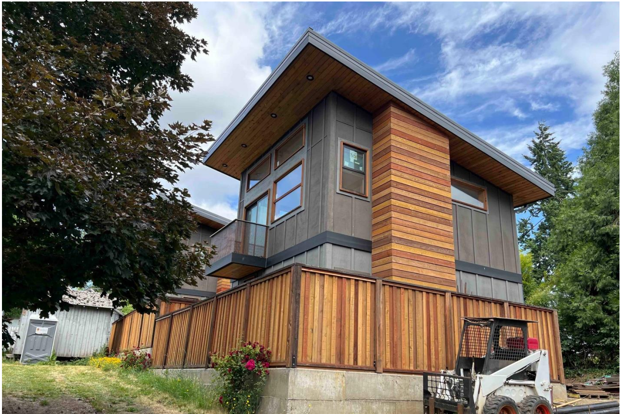
Modern Single-Family Detached House: