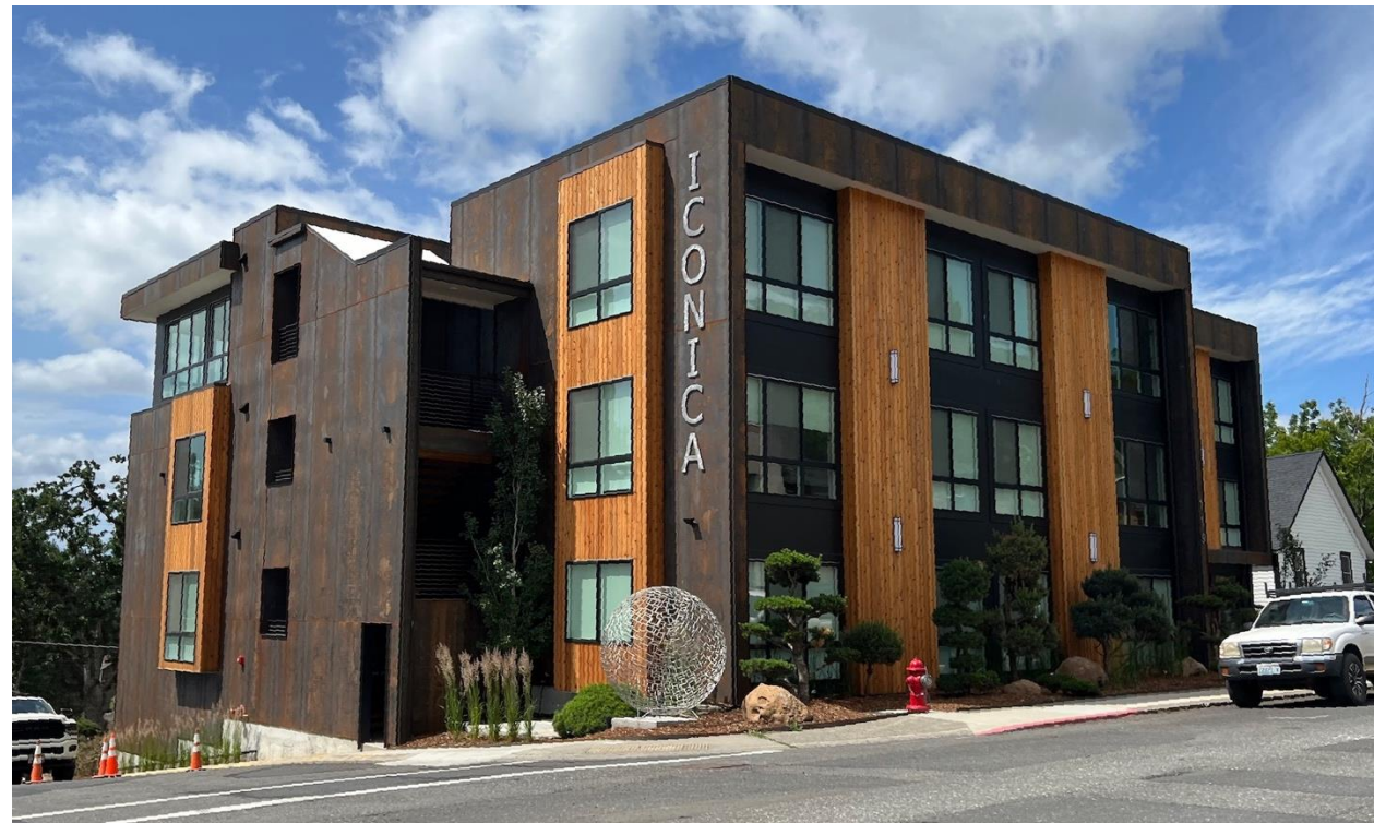
Modern Condominium (#2):