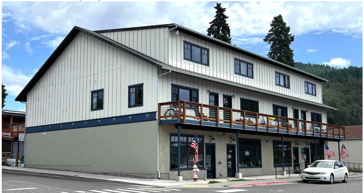
Live-Above Retail (adaptive reuse):