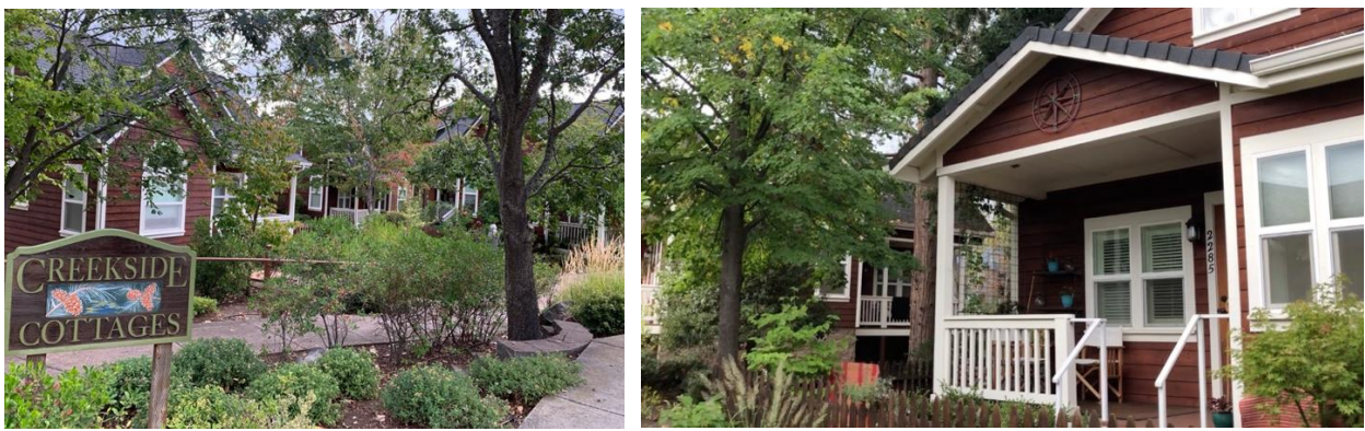
A cottage court neighborhood in Ashland. The city is developing a number of innovative small housing types.