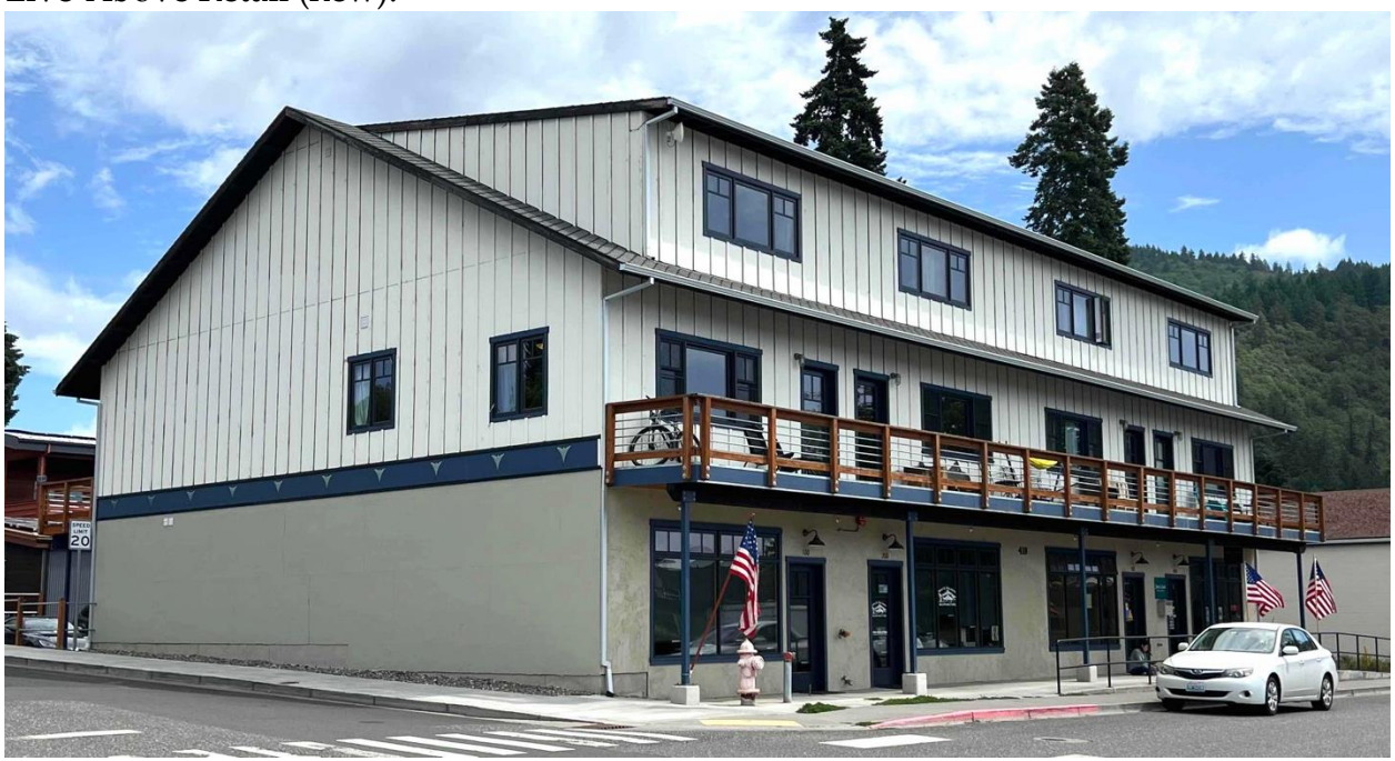
Live-Above Retail (adaptive reuse):