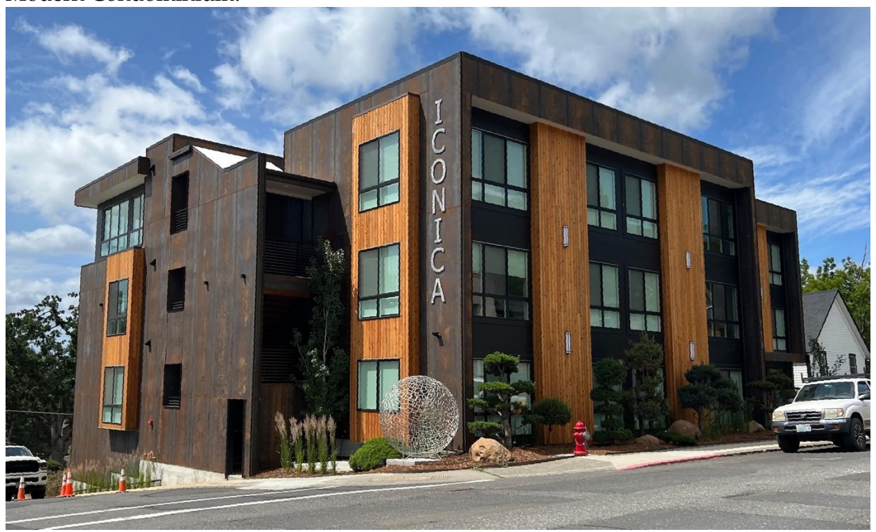
Modern Condominium (#2):