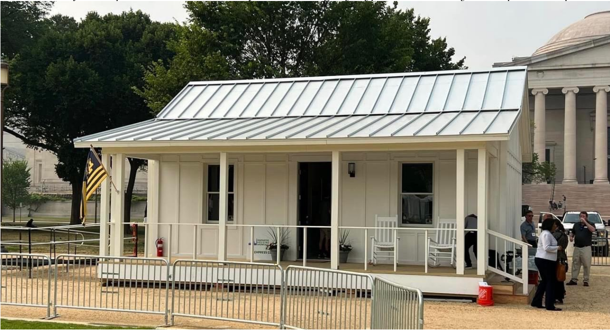
Below, "Tiny Homes on Wheels" demonstrated at the Innovative Housing Showcase:

Above, view of the Capitol Mall. Below, manufactured cottage by Cypress Community Development Corporation