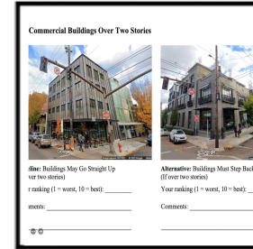
Visual preference surveys