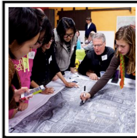
Neighborhood design charrette