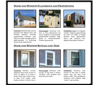
“Clear and objective” design guidelines